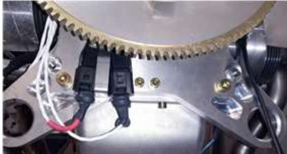
If you have a Single ECU