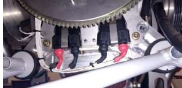
If you have dual Ecu

When reconnecting, make sure to connect them into the correct sensor!!! RED heat shrink = outboard BLACK heat shrink = inboard